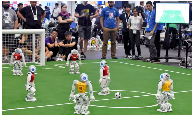
Artificial intelligence programmed robots play football during the RoboCup 2017 in Nagoya, Japan.

"The same vision that it would take for a robot to kick a ball to its mechanical teammate could be used in robots in a manufacturing centre," says Mitchell. "The way a soccer robot can avoid an obstacle on the field? It's the same way an autonomous vehicle might avoid obstacles on the road. The question here is what technologies will come from competitive play? How will the machine behaviour end up being useful to the agricultural marketplace, to autonomous driving, to smart cities?"