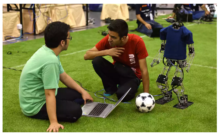
Robot programmers confer at Robocup 2015, in China.

Or at least it does for me. Almost everyone else at Le Palais de Congrès de Montreal, the airplane hangar-like site of the 22nd Robocup International Competition and Symposium, is riveted, if not by what's happening on the various fields of competition, then by what's on their insanely wired laptops, where the programs that will eventually lead to more autonomous robotic sport are being fine-tuned.